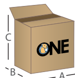
Shipping dimensions A 33" B 13" C 39"